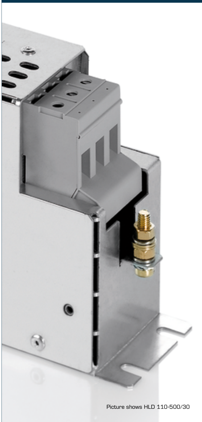
Picture shows HLD 110-500/30